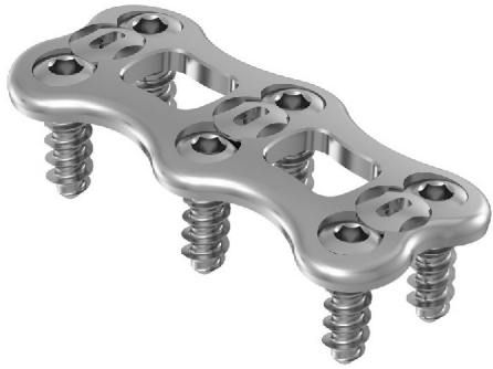
Anterior Cervical Plate-II