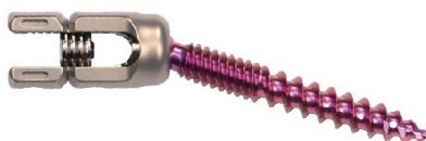
JZKA 6.0 Multiaxial Reduction Pedicle Screw (Rotatable) 43206