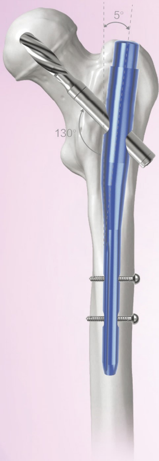
KTO ® -PFNA Gamma Intramedullary Nail System